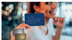
SATA IMAGINE for Frequent Flyers