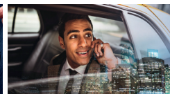
SATA Corporate with preferential fares for Companies