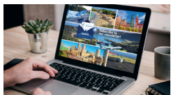
SATA4Agents for Travel Agents