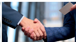
SATA IMAGINE Business for Companies